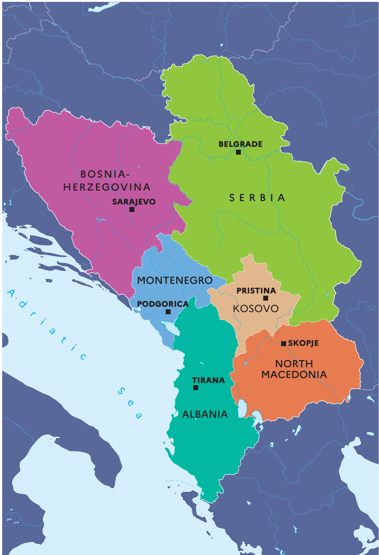
The Western Balkans region includes six countries: Albania, Bosnia and Herzegovina, Kosovo, Montenegro, North Macedonia and Serbia