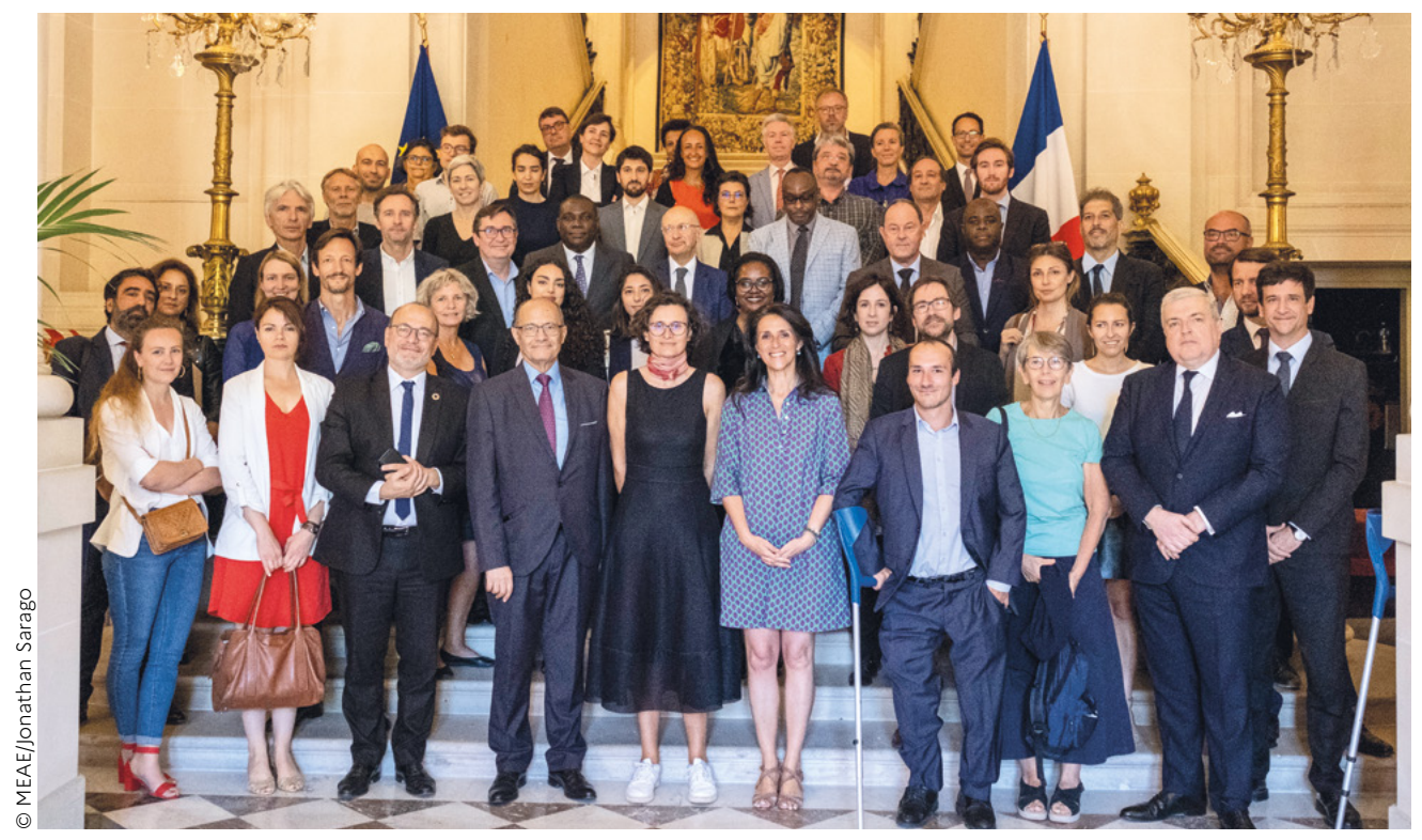
Plenary meeting of the National Council for Development and International Solidarity (CNDSI) on July 5th, 2022.

missions. The CNDSI discusses the annual report on development policy (Art. 3) and it now receives a copy of the ODA evaluation committee report (Art. 12).