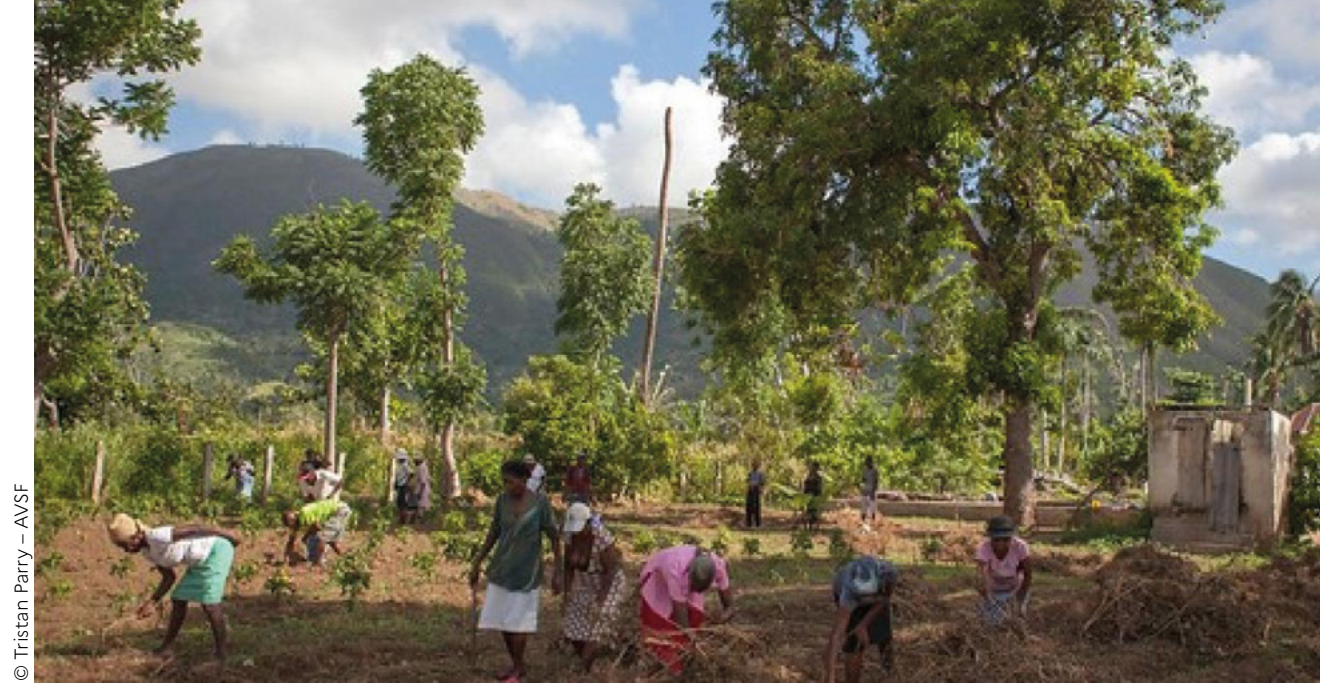
Led by French CSO AVSF (lit. Agronomists and Veterinarians Without Borders), the project "Agroecological Transitions and Resilience of rural territories» helps to strengthen farmers' organizations and civil societies in 15 countries.

potential and to contribute to the sustainable, inclusive and resilient recovery of economies and to the implementation of the 2030 Agenda. The MEAE's "Innovating Together" 14 strategy promotes the new SSE models at international level, recognizes the complementarity of public policies and initiatives driven by the social and solidarity economy sector, supported by appropriate regulations and has helped support and promote innovative multi-stakeholder projects with a considerable social or environmental impact, mainly in Africa. By linking the SSE sector to the issues of international solidarity, it is possible to support projects with an economic dimension by promoting economic models such as fair trade, local distribution channels, energy transition and others that boost cooperation between civil society and between local and regional communities in terms of common challenges.