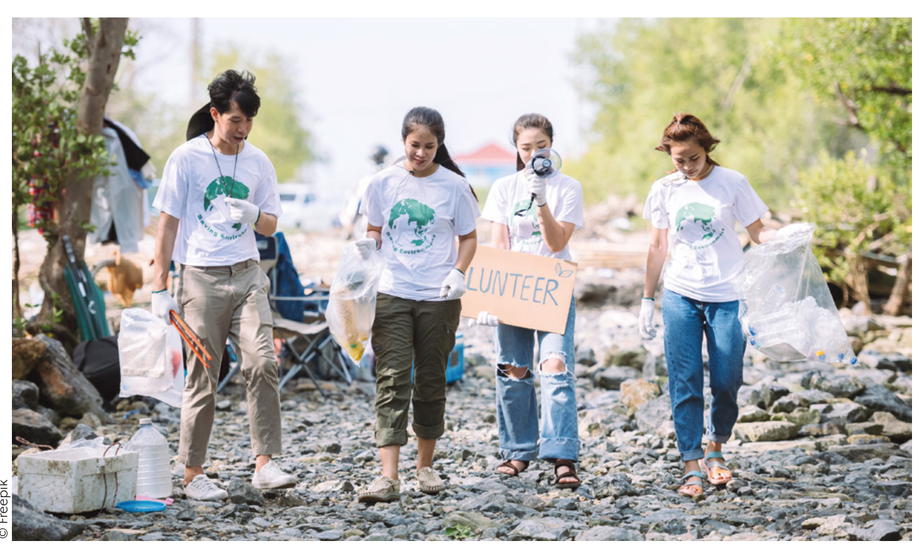
Volunteers acting for the preservation of the environment.