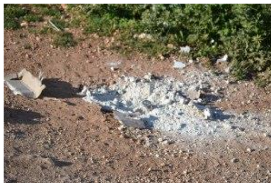
Crater at the third point of impact where the grenade was found

At the third point of impact, an unexploded grenade was found in a crater on a dirt track. This munition was very similar in appearance to that found at the second point of impact.