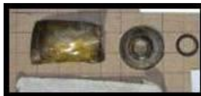
Exploded grenade found at second point of impact

At the first point of impact, there were no victims. At the second point of impact, one person was killed and about 20 injured. An exploded grenade was found in the wreckage. Analysis of biomedical and environmental samples collected by the French services revealed the presence of compounds consistent with exposure to sarin. This analysis was confirmed by the United Nations in December 2013.