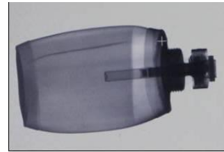
Munition found at third point of impact and an x-ray of it

The chemical analyses carried out showed that it contained a solid and liquid mix of approximately 100ml of sarin at an estimated purity of 60%. Hexamine, DF and a secondary product, DIMP, were also identified. Modelling, on the basis of the crater's characteristics, confirmed with a very high level of confidence that it was dropped from the air.