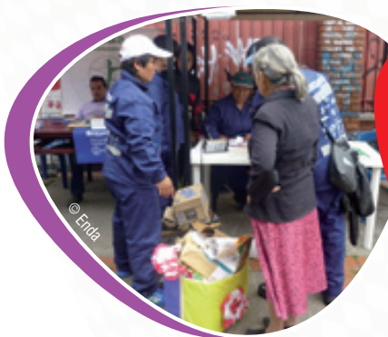
Provision of recyclable waste by residents - Colombia Recycler of metals - Togo Waste transfer station - Vietnam

10 years after the implementation of the 2005 Oudin-Santini Law allowing French local governments to mobilize up to 1% of their water and sanitation budget resources, local authorities now have a mechanism for improving waste management in developing countries.