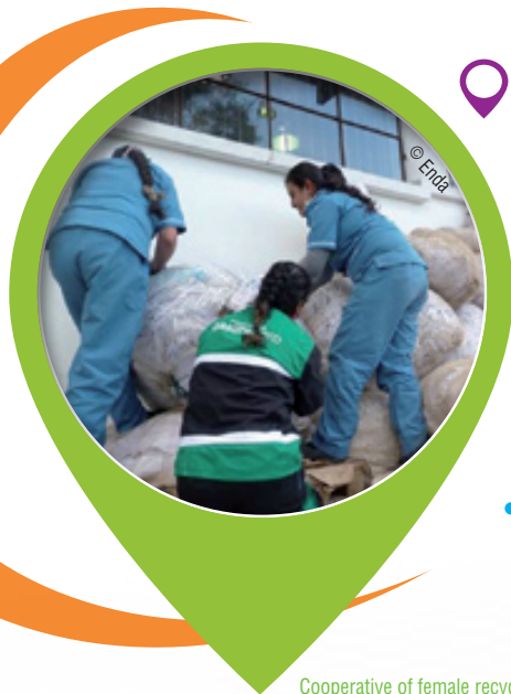
Cooperative of female recyclers, Loma Verde Packaging of recyclable waste for resale - Bogota - Colombia