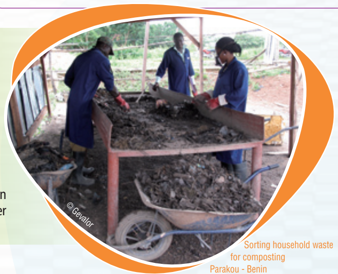
Sorting household waste for composting Parakou - Benin