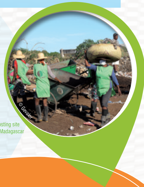
Work on composting site Mahajanga - Madagascar