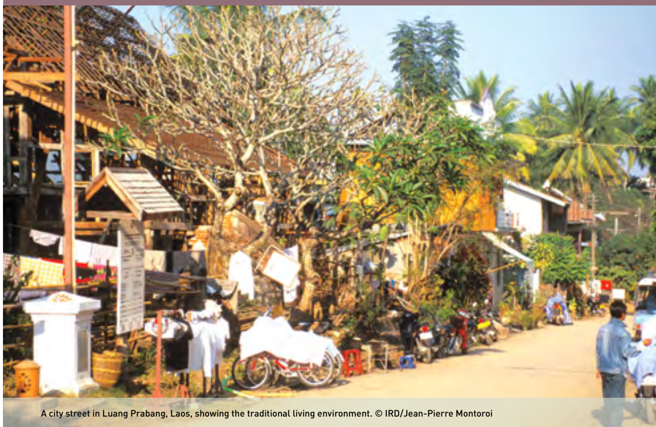
A city street in Luang Prabang, Laos, showing the traditional living environment.

The city of Chinon and France’s Centre region contributed to creating the municipality of Luang Prabang in the framework of implementing Laos’ decentralization, including by building administrative capacities and undertaking population outreach operations regarding urban and environmental themes. Lastly, this cooperation contributed to cooperation projects in the fields of water management and the development of the Mekong’s river heritage.