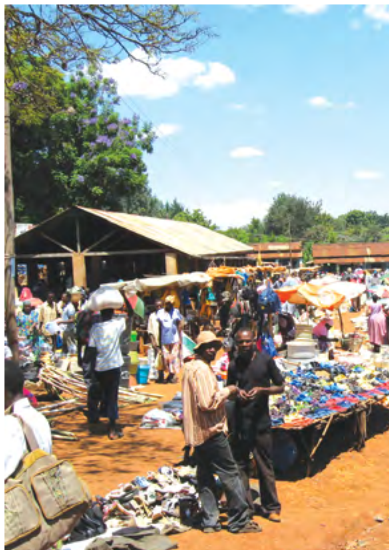
Kibuye Market in Kisumu, Kenya.

The recognition of land property and usage rights, be they individual or collective, must of course not lead to impasse on the regulation of competing usages of land and related rights. This regulation involves reflection on the evolution of systems administrating