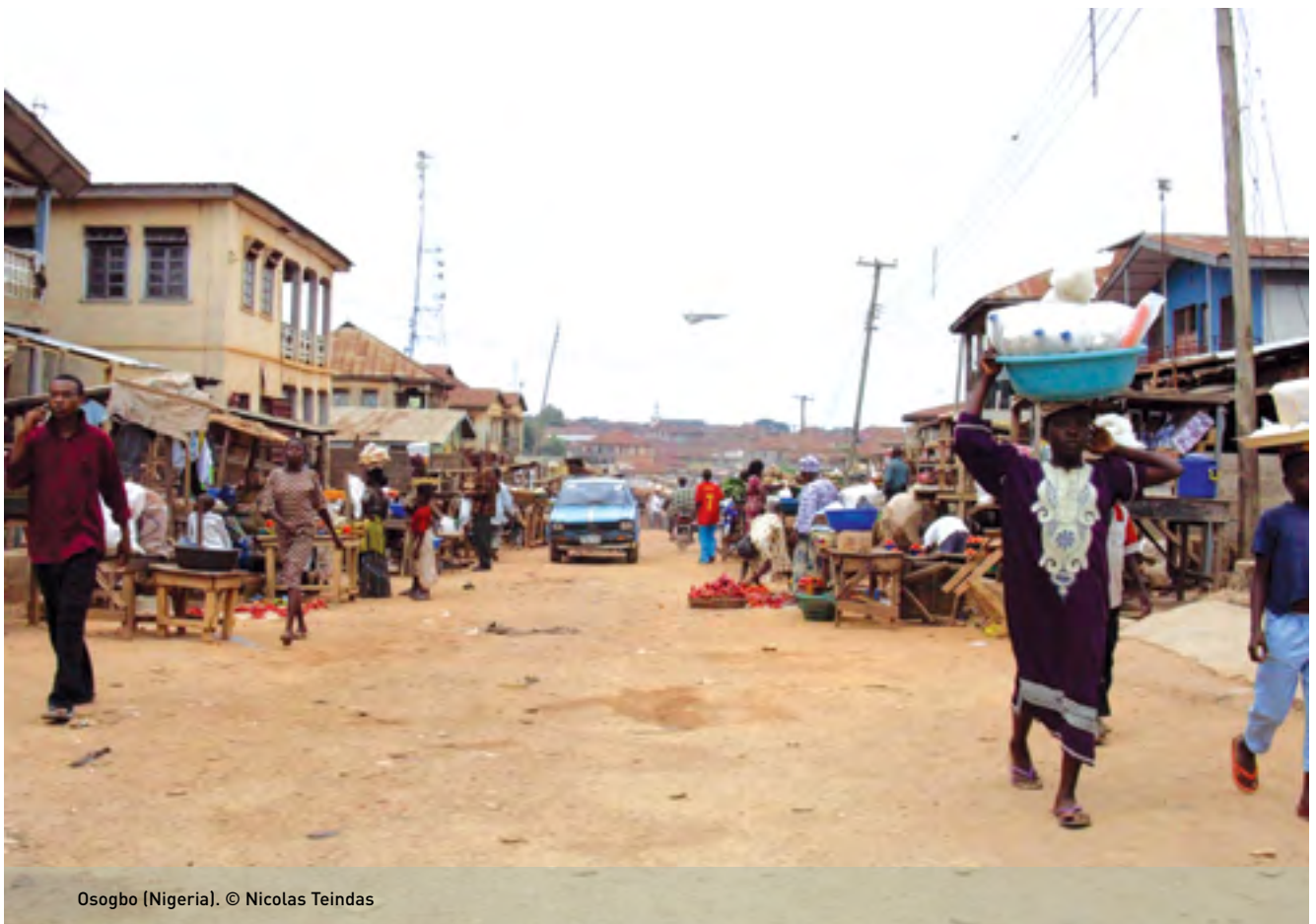
Osogbo (Nigeria).

This means helping France's partners define policies to finance their urban strategies and to translate them into financially sustainable investment programmes.