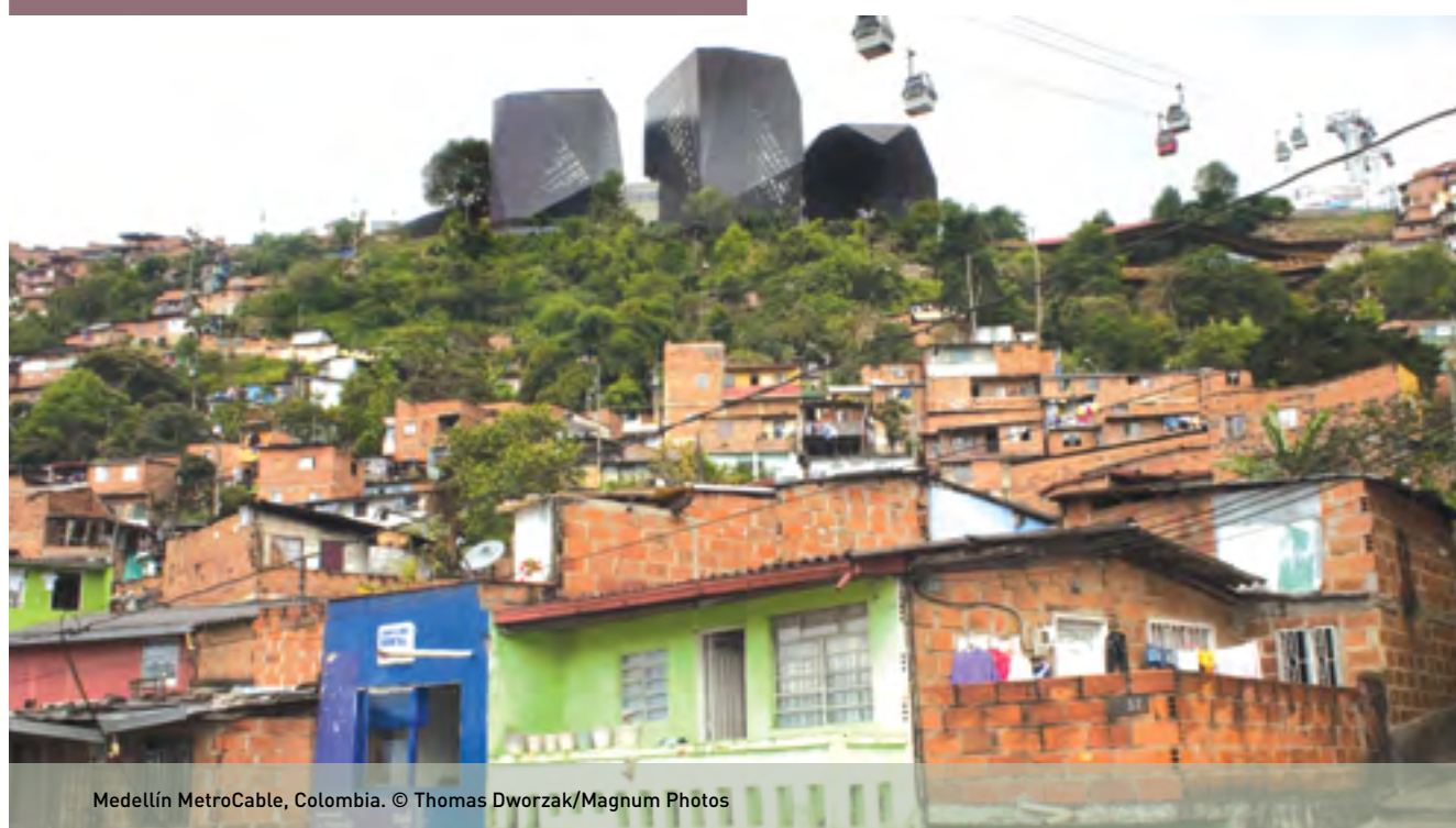
Medellín MetroCable, Colombia.

Since 2006, France has had a "Governance strategy" to address the multiple challenges of development and strengthening the rule of law, democracy and human rights, including economic, social and cultural rights. Building on the support our country provides to decentralization and deconcentration processes, this strategy promotes democratic governance defined as "the art of governing, adapting the management of public affairs to different territorial scales, regulating relationships within society and coordinating the intervention of a multitude of actors".