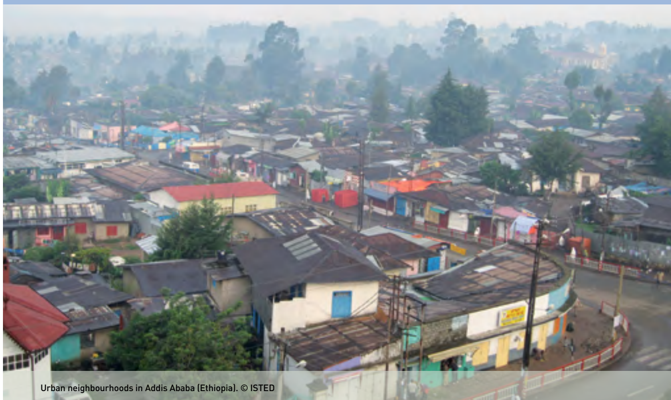
Urban neighbourhoods in Addis Ababa (Ethiopia).