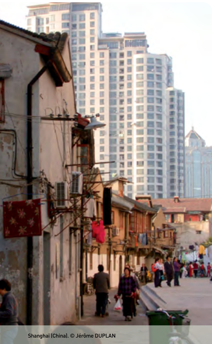
Shanghai (China).

H alf of the world's population now lives in towns. Very rapid urban growth is predicted for the next two decades, 95% of which will take place in developing countries because of the combined effects of rural exodus and demographics.