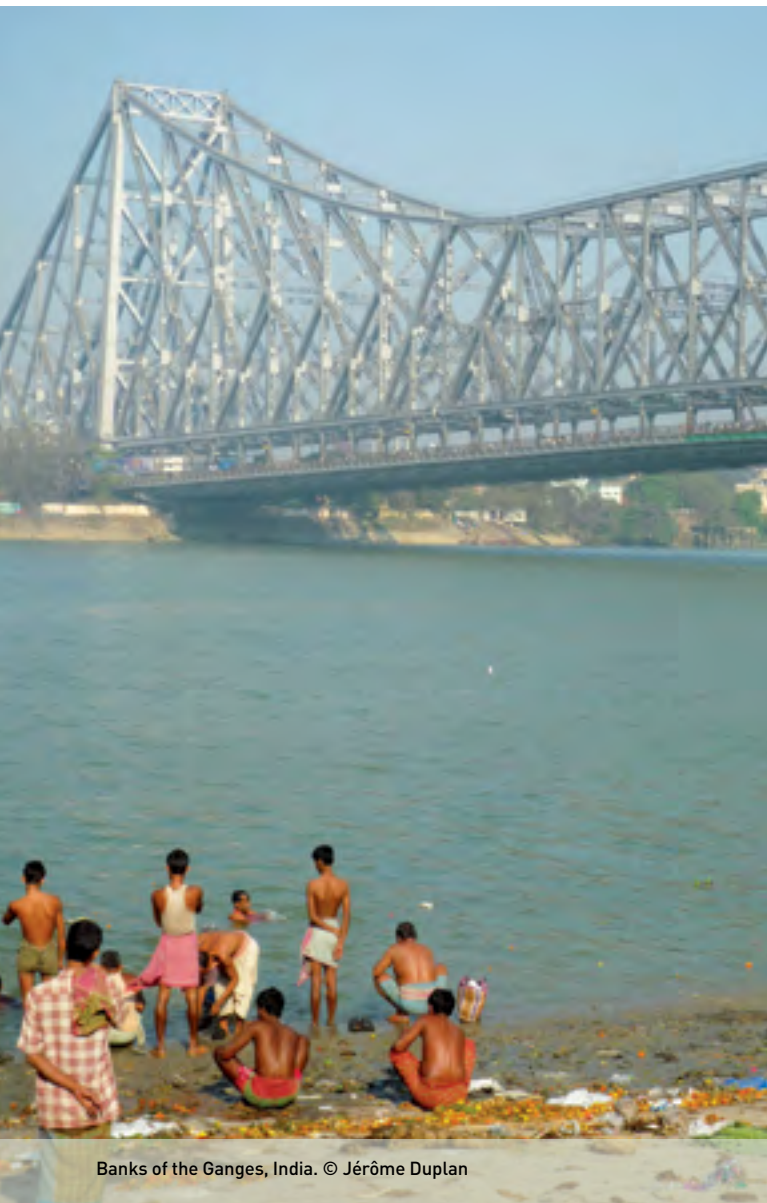
Banks of the Ganges, India.

France's support in the framework of its partners' specific governance processes may concern the complete chain of actions, including inventories, legislation, mobilization of human and financial resources, support for operational implementation, and capi-