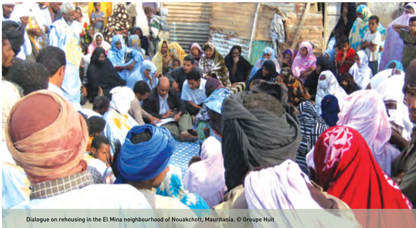
Dialogue on rehousing in the El Mina neighbourhood of Nouakchott, Mauritania.