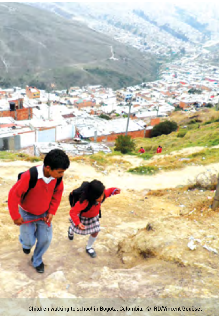
Children walking to school in Bogota, Colombia.

A cooperative effort is therefore needed to combine preparation and implementation of urban strategies with strengthening governance and local capacities.