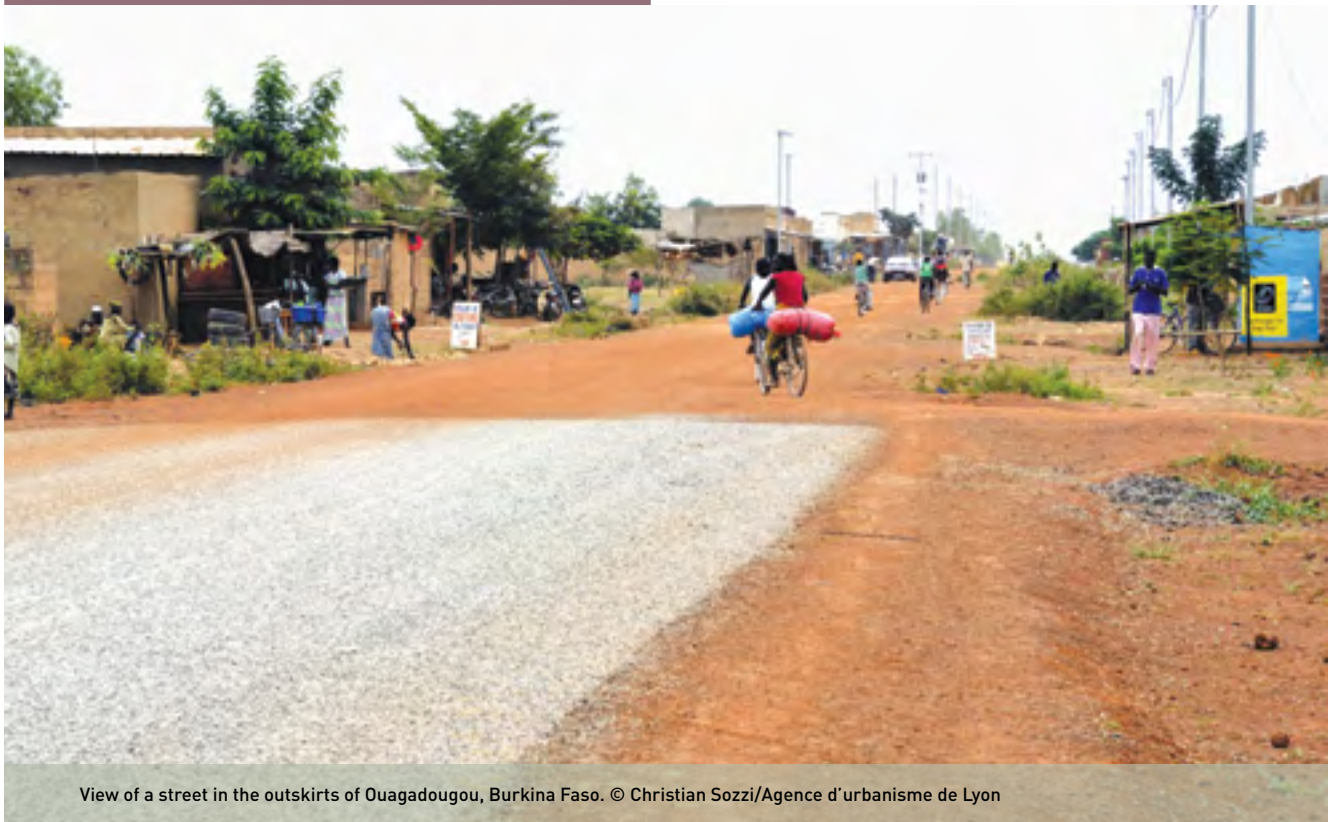
View of a street in the outskirts of Ouagadougou, Burkina Faso.

At local level, the fundamental level of democratic governance, local governance appears to be a condition to support sustainable development adapted to the needs, interests and rights of populations and to tend towards the achievement of the Millennium Development Goals (MDGs). The European Charter on development cooperation in support of local governance 1 states that local democratic governance constitutes a "decision-making and implementation process of public policy that, around local governments [...], encourages an equal participation of all stakeholders of a territory (State, citizens, civil society, private sector), reinforces accountability towards citizens and responsiveness to social demands in seeking for the general interest".