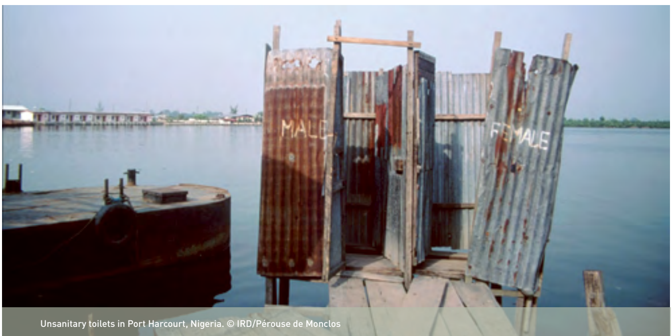
Unsanitary toilets in Port Harcourt, Nigeria.

These orientations constitute the basis of France's urban cooperation offer which brings together domains that are typically handled using a sectoral approach relying on the implementation of the French Alliance for Cities and Territorial Development (PFVT) , a multi-actor platform for dialogue and development of French urban expertise, aimed primarily at enhancing the effectiveness of French urban cooperation.