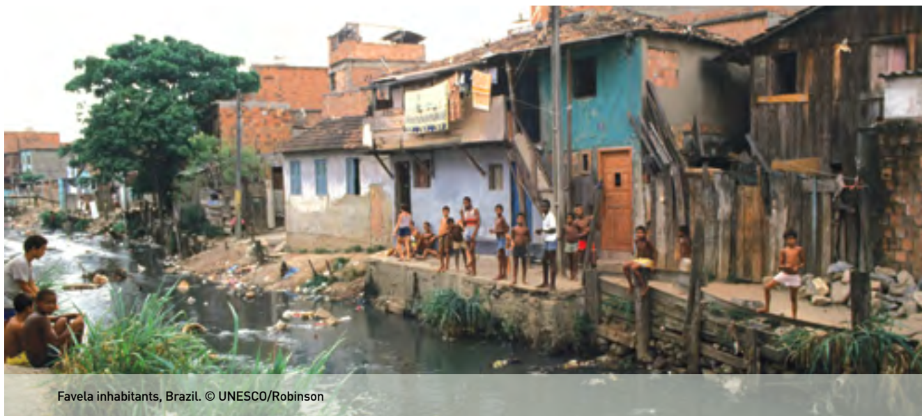
Favela inhabitants, Brazil.

Today, the interaction of these authorities with those involved in economic development, professional training, academia and research has become decisive. Faced with the globalization of the economy, local authorities now have every reason to facilitate the development of local productive systems, centres of excellence and competitive clusters and any form of strategic planning and development actions that foster economic development, such as boosting urban attractiveness and supporting the implantation of economic activity.