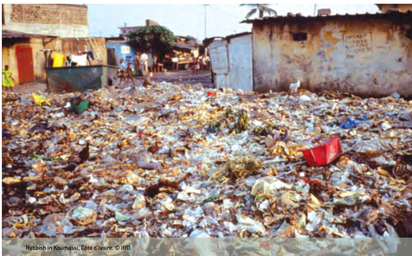
Rubbish in Koumassi, Côte d'Ivoire.

These services are delivered and managed thanks to cooperation and coproduction involving the State, local and regional authorities, the population, public services and the private sector, knowing that public authorities acquire legitimacy largely thanks to their ability to provide these services to the entire population. Their implementation requires ad hoc organizations, created for their specific structure but also for the culture, customs, training and experience of their members (capacity for dialogue and cooperation reinforced by experience-sharing) and holding suitable financial resources.