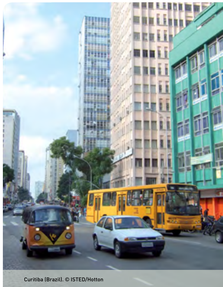
Curitiba (Brazil).

Founded on deep knowledge of local contexts and on the construction of partnerships, the French offer draws its political legitimacy from dialogue with its partners. It is integrated and brings together fields which are usually handled in a sector-specific manner. The French Alliance for Cities and Territorial Development is the basis for the formulation of its principles.