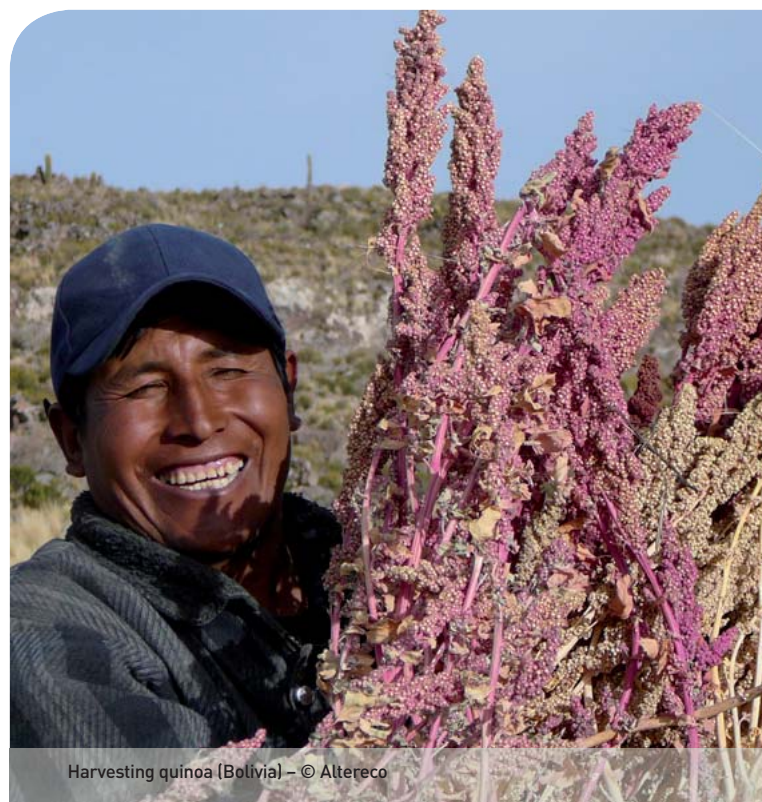
Harvesting quinoa (Bolivia)