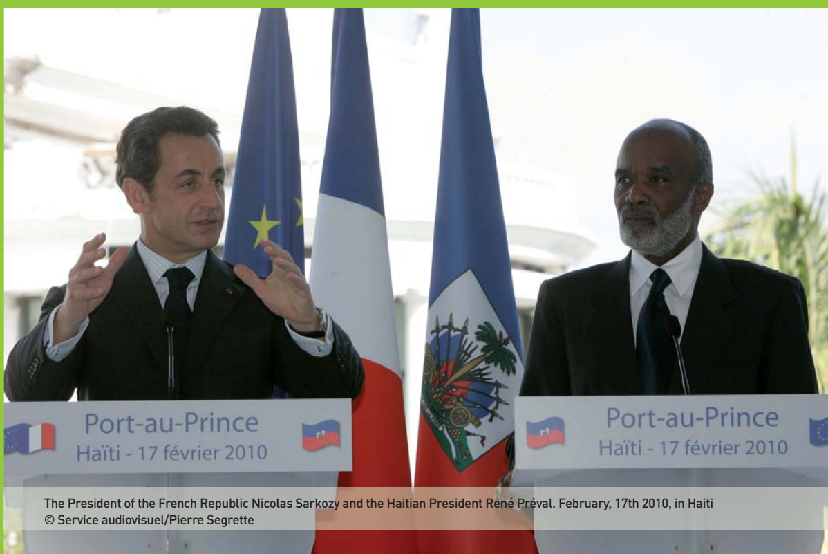
The President of the French Republic Nicolas Sarkozy and the Haitian President René Préval. February, 17th 2010, in Haiti