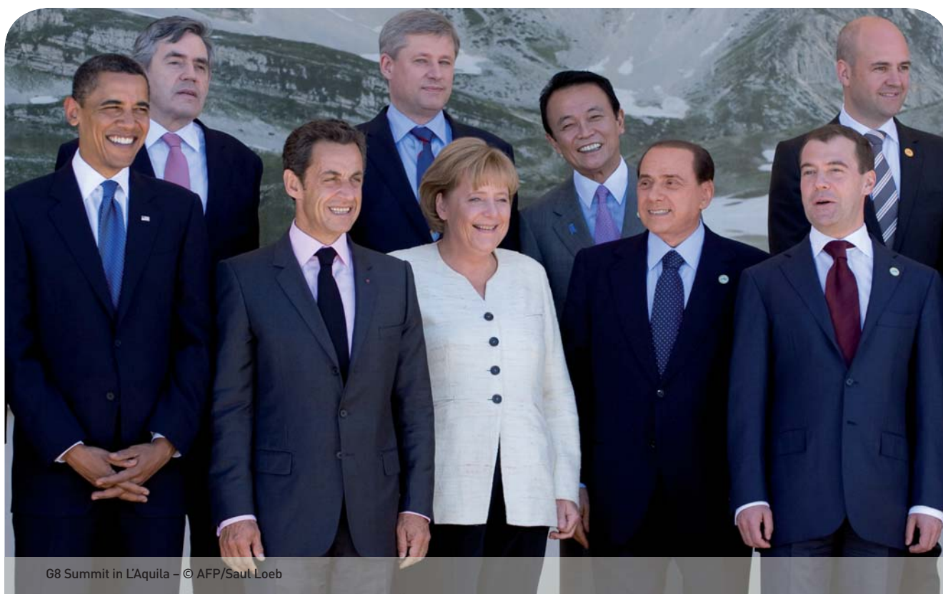
G8 Summit in L'Aquila

This document does not aim to be exhaustive, but, as a complement to the G8 report, presents several significant examples of France's specific contributions to this collective effort. It bears witness to a renewed willingness to engage in dialogue with all stakeholders, who see even more effective and transparent development assistance, combined with international cooperation adapted to the realities of the 21st century, as meaningful responses to the challenges raised by globalization.