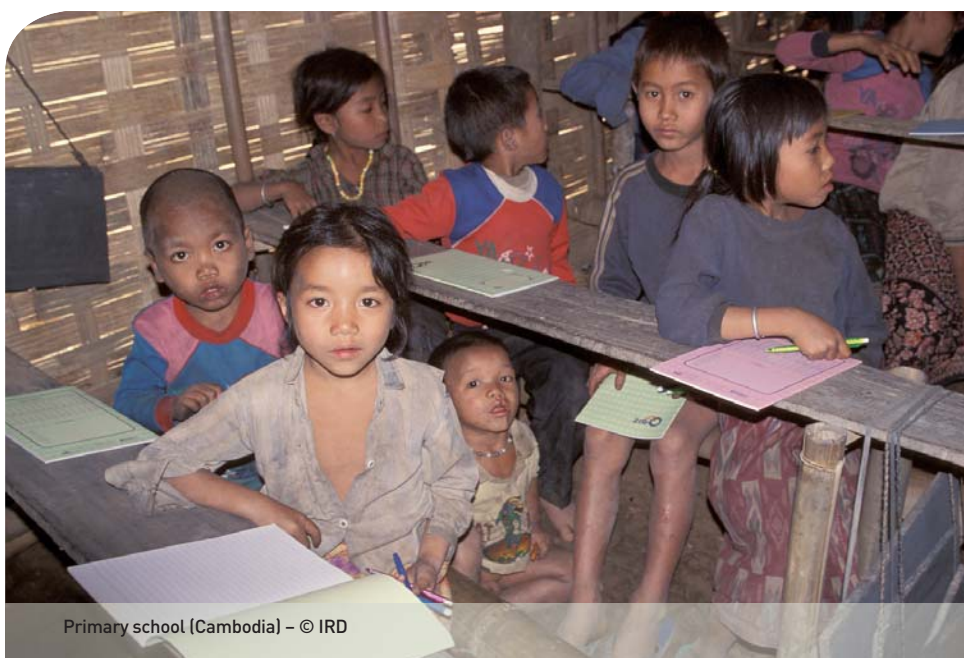
Primary school (Cambodia)

has renewed its support and involvement by donating €50 million to the initiative's Catalytic Fund for the 2010-2012 period. It also mobilized €957 million in bilateral contributions to basic education for the 2003-2008 period.