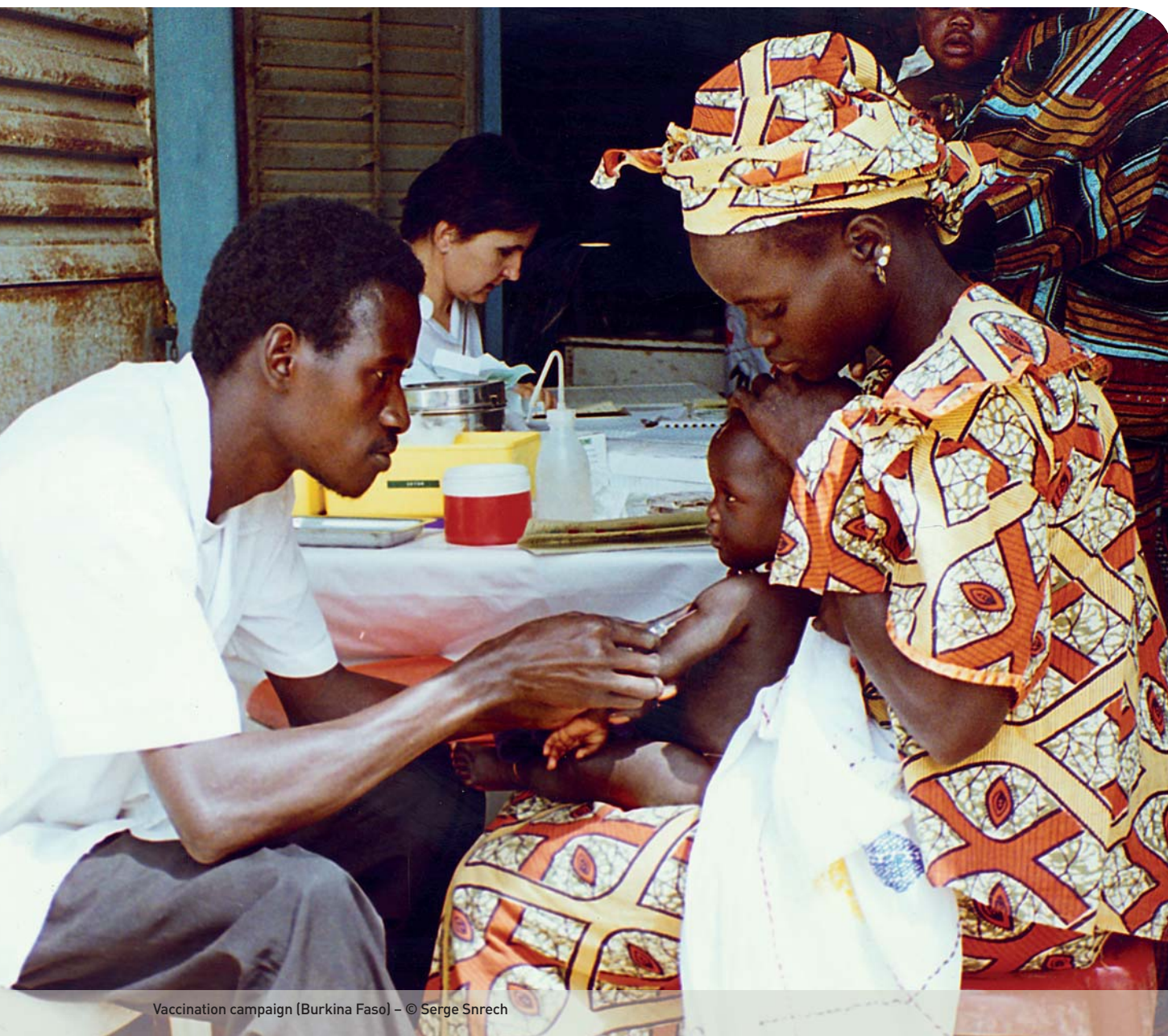
Vaccination campaign (Burkina Faso)

Moreover, out of France's total contributions to the Global Fund and UNITAID, which demonstrate the country's significant commitment to MDG 6 (Combat HIV/AIDS, malaria and other diseases) 50% goes toward to achieving MDGs 4 and 5 as well.