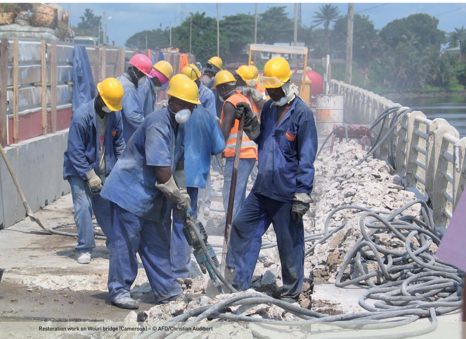
Restoration work on Wouri bridge (Cameroon)