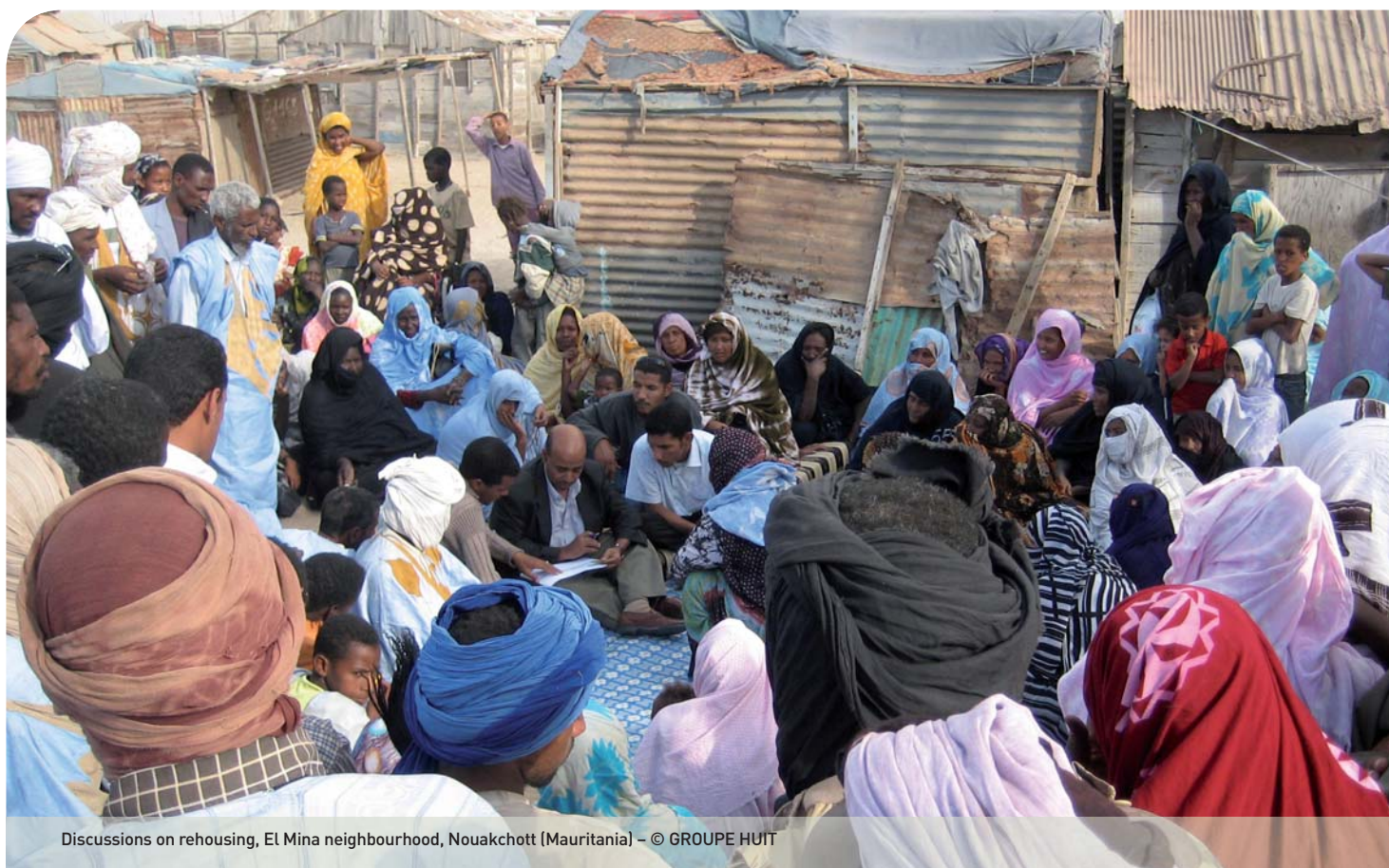
Discussions on rehousing, El Mina neighbourhood, Nouakchott (Mauritania)

French action therefore fully complies with the commitments defined in the Accra Agenda for Action.