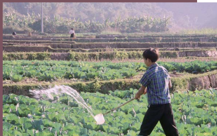
Manual irrigation (Vietnam)

More generally speaking, as part of its cooperation policy regarding water and sanitation, France delivers aid to the African Development Bank, providing financial support to two dedicated trust funds: the African Water Facility (AWF) and the Rural Water Supply and Sanitation Initiative (RWSSI), to which France is the largest contributor, and which has provided access to water and sanitation for 27 million and 22 million people respectively since its creation.