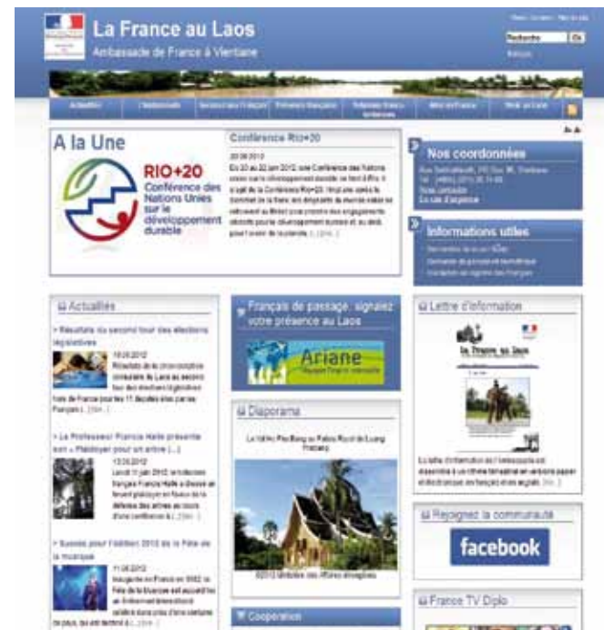
French Embassy in Laos homepage