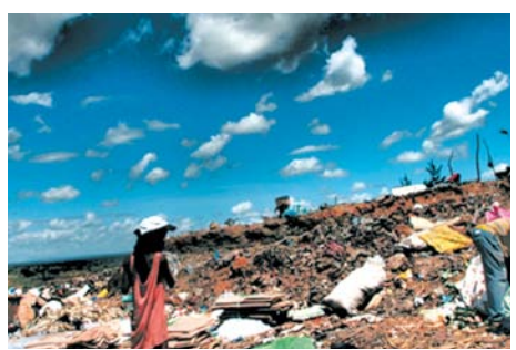
Waste management in Mozambique - Maputo and Matola / Seine-Saint-Denis departmental council