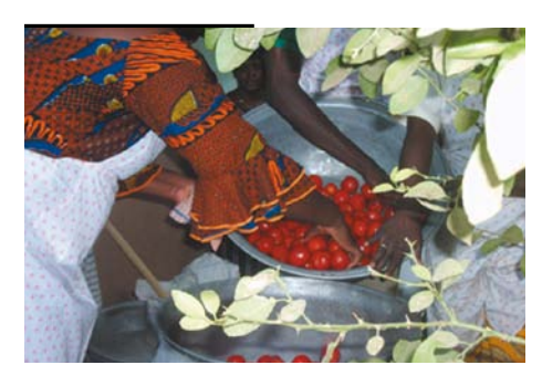
Green and fair economy in Burkina Faso