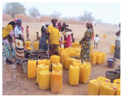
Access to drinking water in Niger - Dankassari/ Cesson-Sévigné