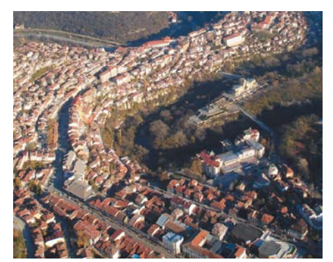
Heritage and urban governance: Veliko Turnovo (Bulgaria) / Bayonne