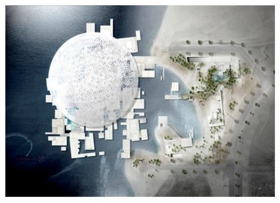
Aerial view of the building with the dome designed by Jean Nouvel